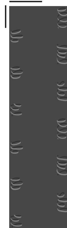
18" x 30" SECTION