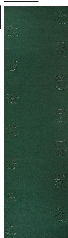
34.5" x 122" SHOWN