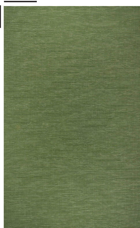
6' x 9' SHOWN