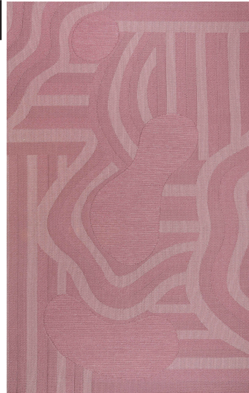
6' x 9' SHOWN