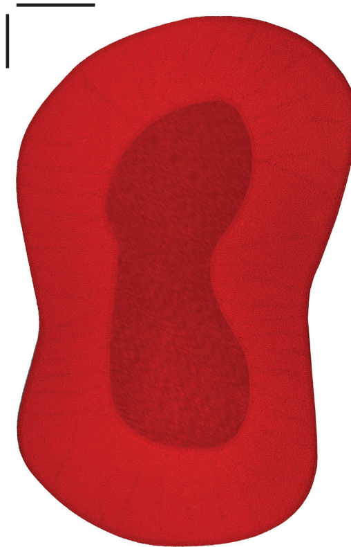
6' x 9' SHOWN