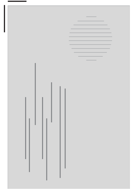
11" x 16" SECTION ROTATED