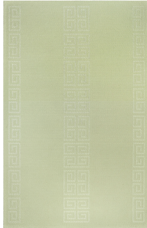
6' x 9' SHOWN