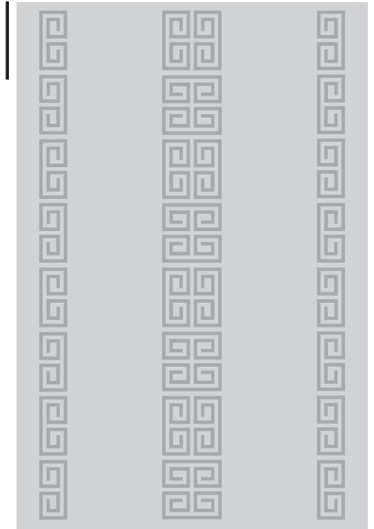
11" x 16" SECTION ROTATED