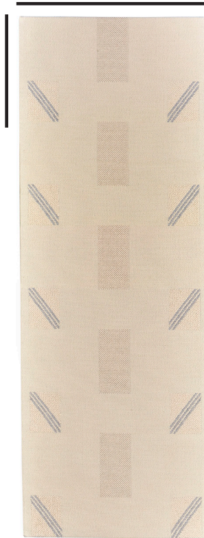
2' 6" x 7' 6" SHOWN