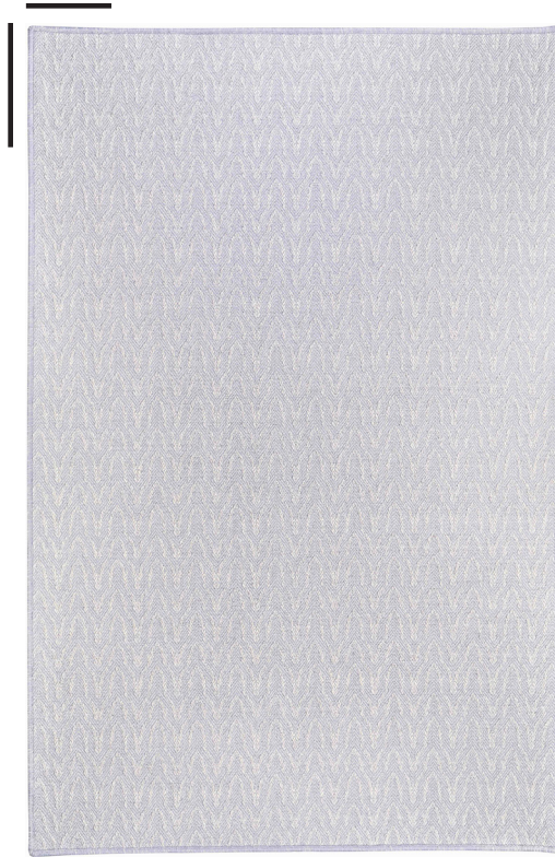
6' x 9' SHOWN