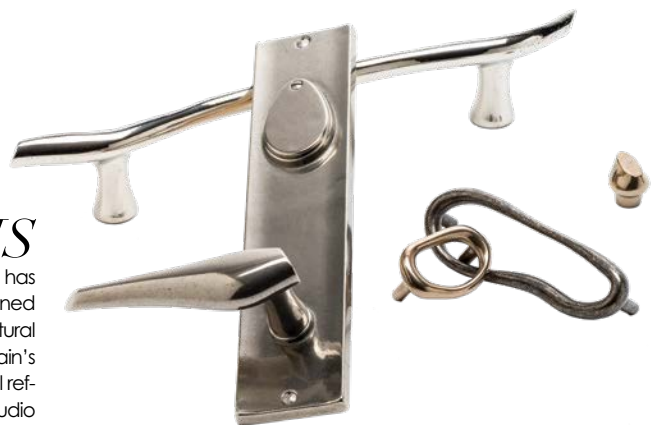
CLOCKWISE FROM TOP RIGHT: COURTESY OF PIERRE FREY; COURTESY OF ROCKY MOUNTAIN HARDWARE; COURTESY OF KOHLER.

Rocky Mountain Hardware, the leading manufacturer of solid bronze hardware, has released Oasis, a sculptural hardware collection created in collaboration with renowned architectural firm RAMSA. The new line features cabinetry and door hardware in natural and organic forms, each with a level of detail only made possible by Rocky Mountain's advanced technology. "While designing Oasis, we were inspired by historic architectural references and the Arts and Crafts movement," says Lawrence Chabra, RAMSA interiors studio director and associate. "The result is a sculptural collection that juxtaposes the structural quality of doors and millwork with the inventiveness and craftsmanship of jewelry, featuring design elements that are similar to gem cutting." rockymountainhardware.com