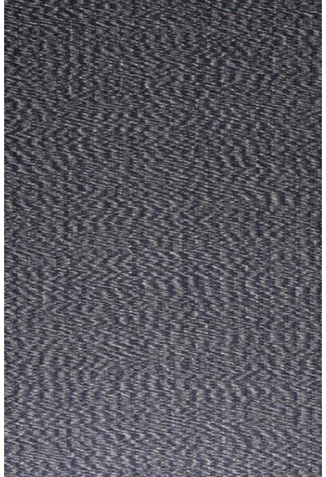
6' X 9' SHOWN Max width 11'6"