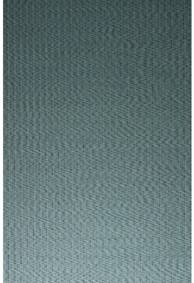
6' X 9' SHOWN Max width 11'6"