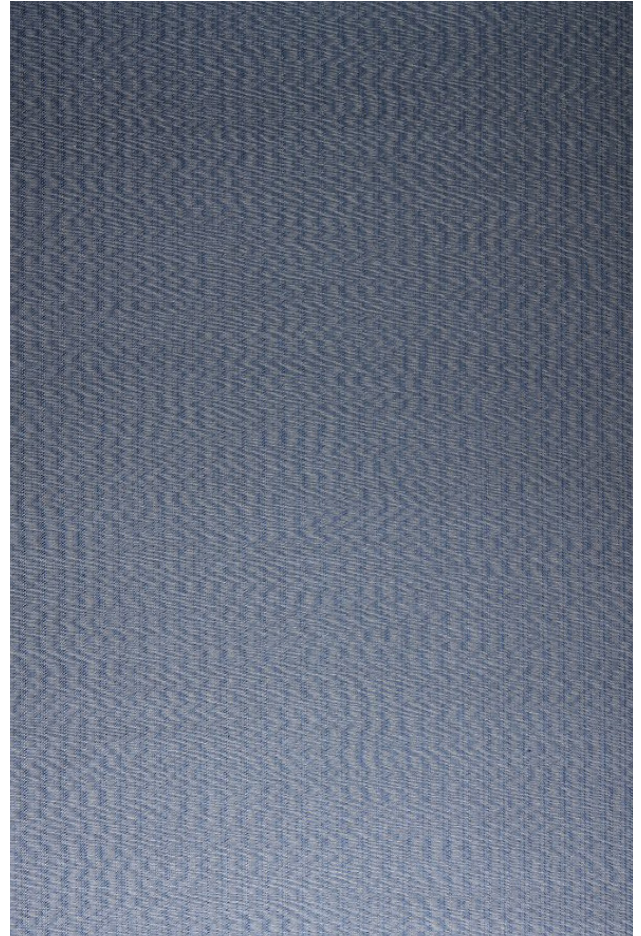
6' X 9' SHOWN