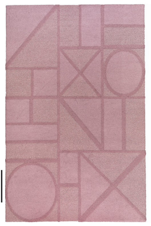
6' x 9' SHOWN