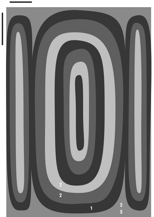
11" x 16" SECTION