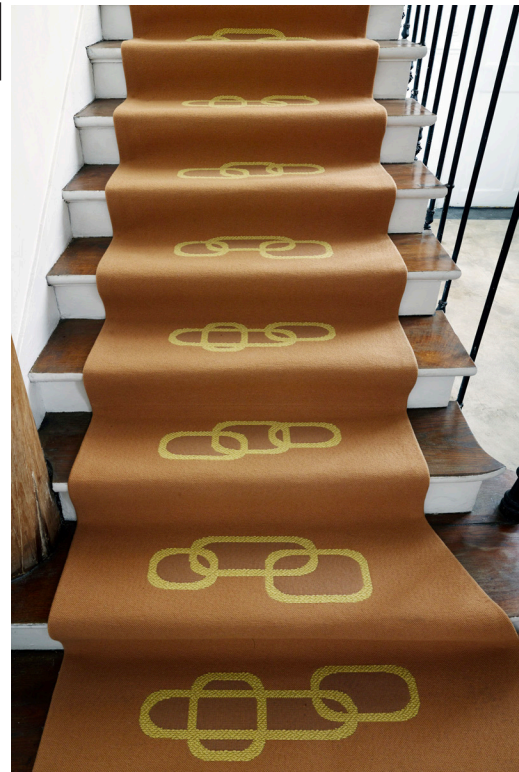
2' 6" x 7' 6" SHOWN