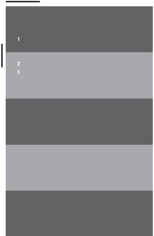
11" x 16" SECTION