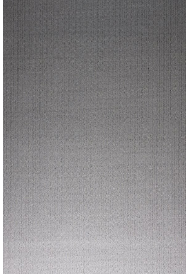
6' X 9' SHOWN