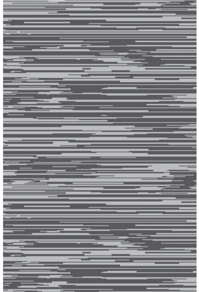
2' X 3' SHOWN Max width 10'