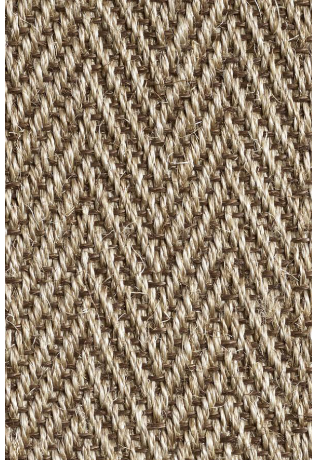
BRITISH KHAKI SHOWN